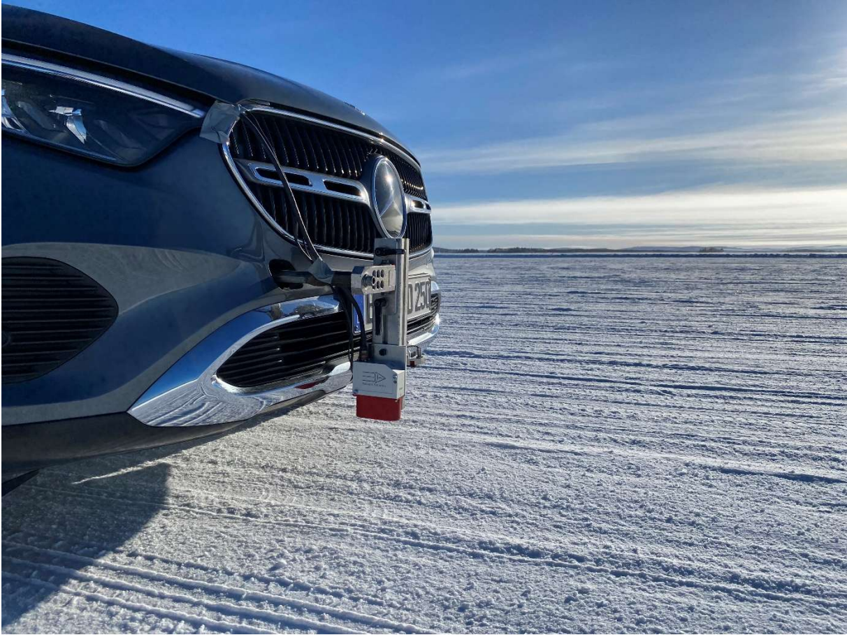
Figure 2: The OMS 7 Sensor Mounted on the Tow Hook of a Mercedes